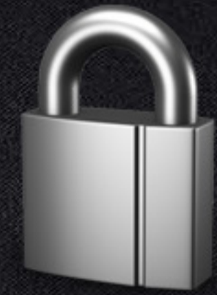
Malware & Security Scans